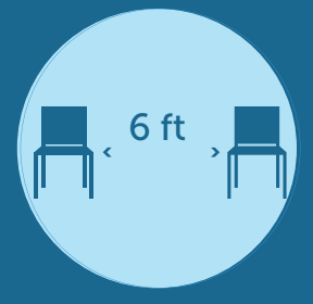
Ensure safe social distancing.